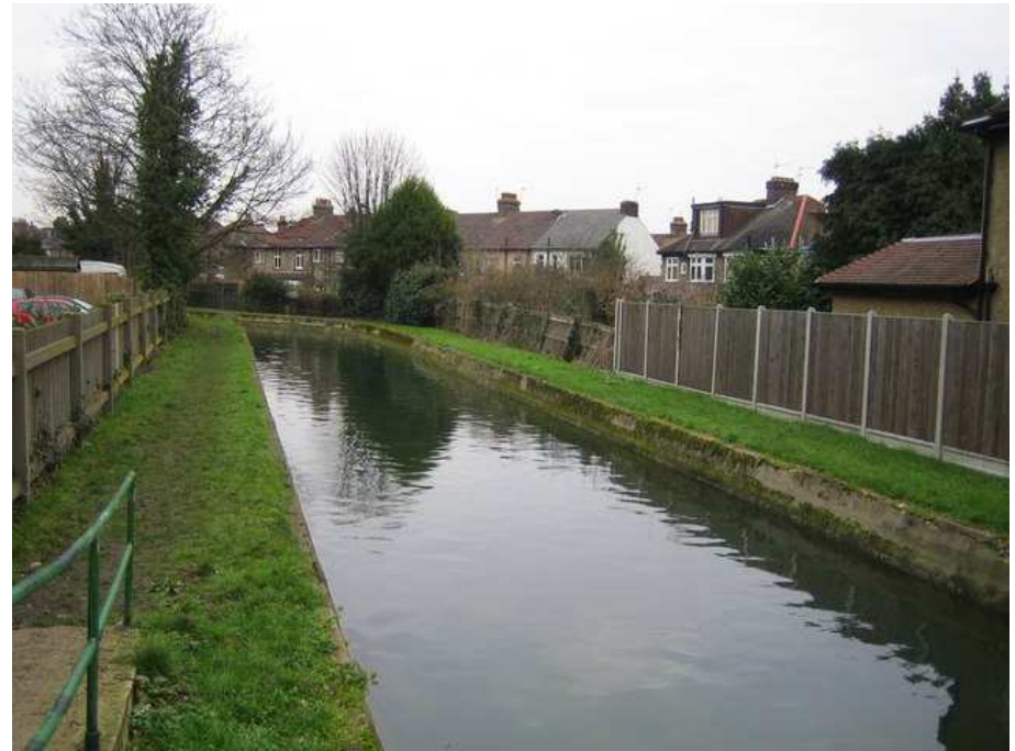
The New River, viewed looking upstream from the Firs Lane road bridge, N21